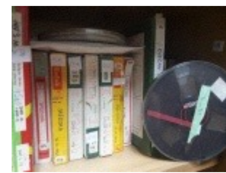
Figure 4. Reel tapes.