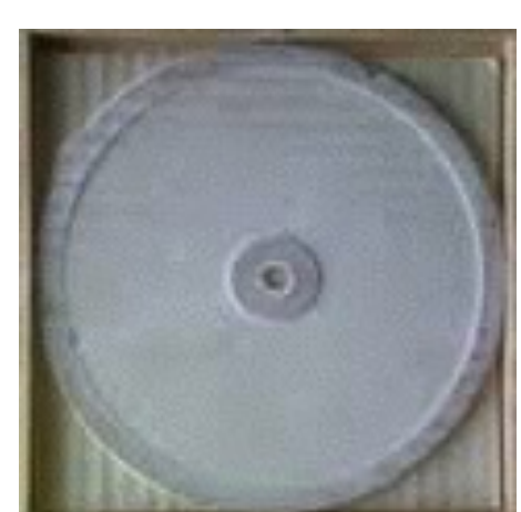
Figure 2. Wax plate.