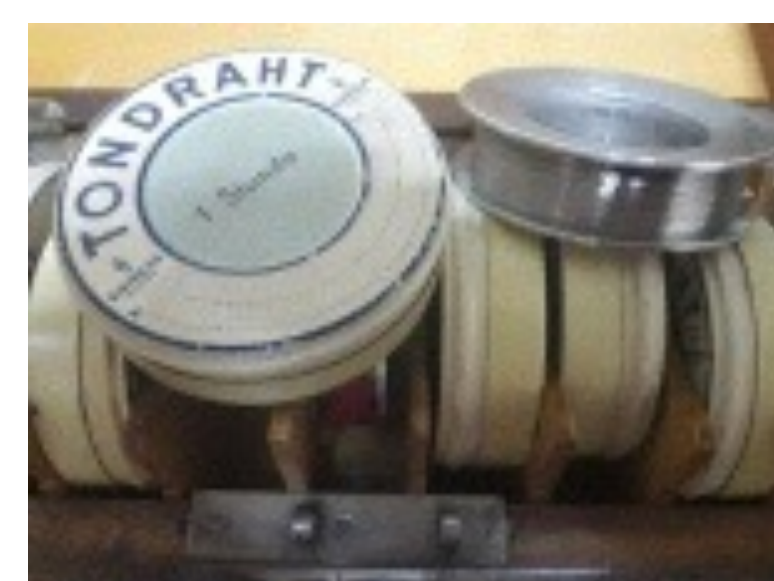
Figure 3. Wire reels.