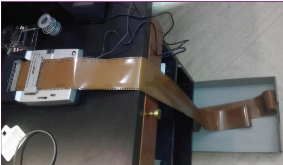
Image 1. The above photo shows the working Rols audio player that was purchased with one of the Rols dictation tapes loaded onto it. The device was designed without a take-up reel so the audiotape just spools off onto the floor as it plays or records. 155

During the intervening years, the researcher was able to secure a machine and donated it to the State Archives with the belief that it was functional. Unfortunately, while we were able to get the new machine to power on and briefly hear sound for one of the Rols tapes, it became clear that there was a problem with the machine. In the hope that this new player could be repaired, staff searched online and contacted local audio repair shops but were unable to locate somebody willing to work on the machine. Most of the repair shops cited the lack of parts for and information about this relatively unknown format as the reasons they were not able to attempt to repair the Rols machine. Given the lack of alternatives and using the patent drawings, we determined that one of the compression spring switches, which allowed the reading arm of the Rols player to change direction was broken. Once again, the State Archives was left without a way to play the Rols audio or transfer the audio to another medium. Our luck changed in 2013, when a functioning machine, complete with all of the accessories, was listed for sale on eBay. Realizing that we may never again see a Rols machine, let alone have the opportunity to buy a functioning machine, the State Archives purchased it for $3,000.