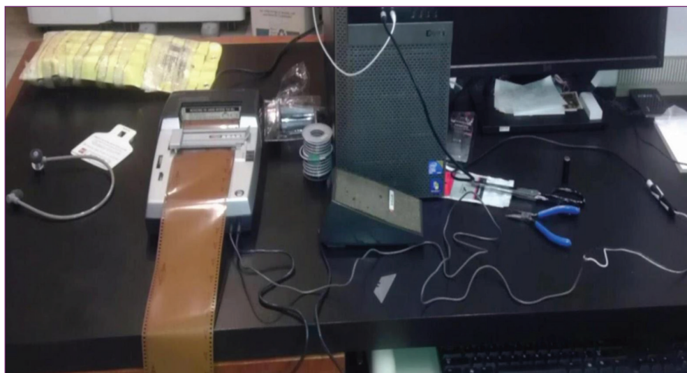
Image 3. The above photo shows from left to right: headphones without the cable attached; Rols audio player; audio wire and its packaging; computer; and in front of that is the foot pedal used to both play the Rols audio and rewind it depending on the amount of pressure applied to the pedal. The thicker dark cable coming off of the Rols audio player goes to the foot pedal and the smaller one usually attaches to the headphones (far left) but was removed to allow staff to attach wire leads to the new headphone adapter. Finally, an audio line hooks into the new headphone adapter and plugs into the front of the computer (black cable). 162

Digital recordings of the Rols tapes can only be done on a 1:1 basis — one hour of audio equals one hour to record. Because of the time it takes to adjust the recording software settings, make the digital recordings and perform some basic cleanup of the quality, we are only able to complete between 1 and 2 recordings per day. However, some of the audio recordings were damaged along the edges, where holes in the Rologram film are used to advance and rewind the recordings. In these cases, the only way to make the film advance was to repair the torn holes which we did using acid-free polypropylene film tape. Once completed, these repairs allowed the audio recordings to advance properly during playback so that digital recordings could be made.