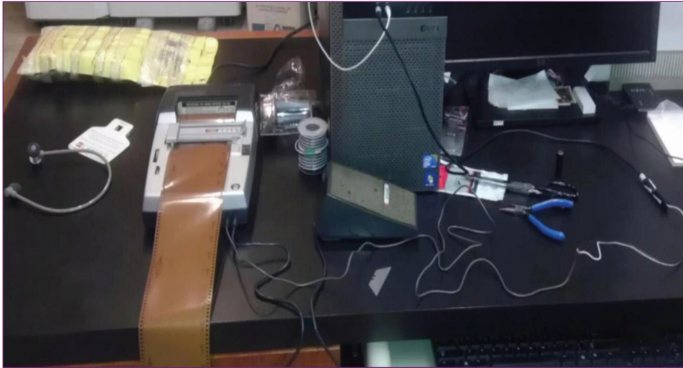
Image 3. The above photo shows from left to right: headphones without the cable attached; Rols audio player; audio wire and its packaging; computer; and in front of that is the foot pedal used to both play the Rols audio and rewind it depending on the amount of pressure applied to the pedal. The thicker dark cable coming off of the Rols audio player goes to the foot pedal and the smaller one usually attaches to the headphones (far left) but was removed to allow staff to attach wire to the new headphone adapter. Finally, an audio line hooks into the new headphone adapter and plugs into the front of the computer (black cable). 162

Digital recordings of the Rols tapes can only be done on a 1:1 basis — one hour of audio equals one hour to record. Because of the time it takes to adjust the recording software settings, make the digital recordings and perform some basic cleanup of the quality, we are only able to complete between 1 and 2 recordings per day. However, some of the audio recordings were damaged along the edges, where holes in the Rologram film are used to advance and rewind the recordings. In these cases, the only way to make the film advance was to repair the torn holes which we did using acid-free polypropylene film tape. Once completed, these repairs allowed the audio recordings to advance properly during playback so that digital recordings could be made.